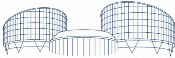
EUROPEAN COURT OF HUMAN RIGHTS COUR EUROPÉENNE DES DROITS DE L'HOMME