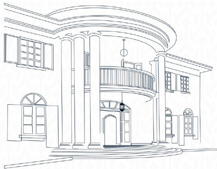
INTER-AMERICAN COURT OF HUMAN RIGHTS